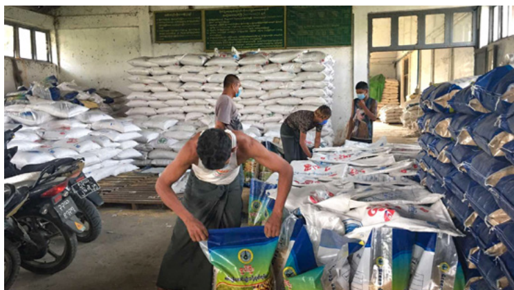
Packaging and storing process in the warehouse of 3G seed company