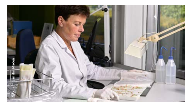
Assessing seeds for germinative capacity

Inspection services that thoroughly monitor and review seed quality are indispensable to the seed sector. "The Dutch inspection bodies are world leaders," says Valstar. The Netherlands Food and