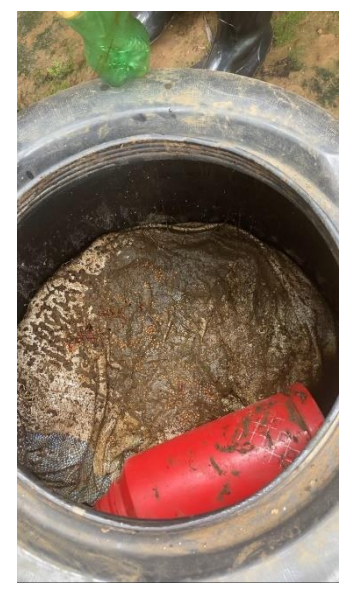
Figure 3 Example of home-made bio-pesticide in the making in Bududa district

Traditional pest control using natural elements is widespread in Uganda. For instance, around the lake Victoria basin in Uganda, 100% of 117 respondents used botanical products for traditional pest management (Mugisha-Kamatenesi et al., 2008). A lack of studies on indigenous knowledge of natural organic pesticides limits further understanding of the effectiveness of the different ingredients.