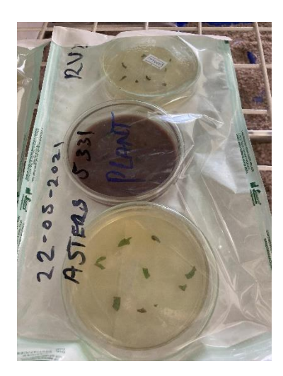
Figure 1 In search of potential 'natural enemies' for diseases

Next to this they also produce several 'biologicals', which are naturally occurring microorganisms, plant extracts, beneficial insects or other organic matter, all sourced from Uganda. The products they produce are fungi, bacteria or mites that are 'natural enemies' for common pests and diseases.