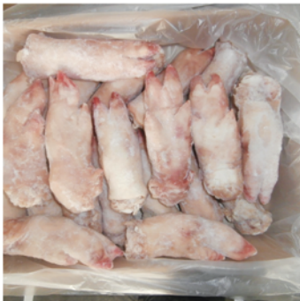
Frozen pork front feet, (scalded without nails with 14-16 cm in length and weight near 350 g)

We managed to gather a team of specialists who are qualified in different sectors of the industry. For every employee the common objectives of the Company are in the first place. And the success of the Company is the result of work of the whole team. We believe that the atmosphere of effective work consists of trust and openness to each other. The high professional level of our employees guides us into the winning track, and due to this LTD "Agro-Invest" has repeatedly been honored with "Importer of the Year", "Enterprise of the Year", and "Industry Leader" awards.