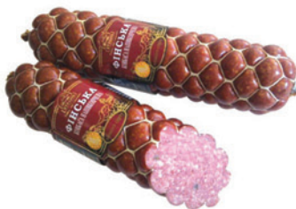
Finska semi-smoked sausage

Quality and safety standards of our products comply with international norms and standards.