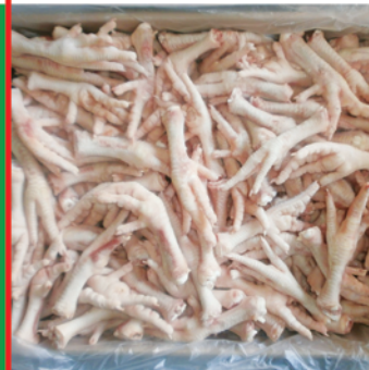
Frozen chicken feet, (feet peeled from the skin, corns and nails. Average weight is near 45g , lengths is near 15 sm)