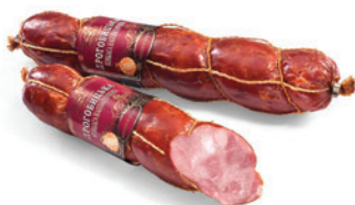
Drogobytska semi-smoked sausage