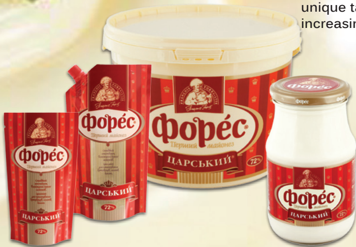
Table high-calorie mayonnaise "Tsarskyi" is a product with uniform, stiff consistency with single air bubbles, of creamy- yellow colour, smooth mass. Contains 72% of fat. Energy value of 100 g of product is 665 kcal.

The enterprise uses its own technology and unique recipes of mayonnaises. Owing to the well-run work of professionals-engineers and researchers, new original ideas and formulations are developed, the unique taste of mayonnaise is created, and production volumes are increasing.