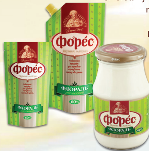
Table high-calorie mayonnaise "Floral" is a product with uniform, stiff consistency with single air bubbles, of creamy colour, smooth mass. Does not contain animal origin products. Mayonnaise for fasting, diet or healthy eating. Contains 60% of fat.

TM "FORES" table high-calorie mayonnaise "Floral" 440 g.