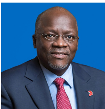
H.E. Dr. John Pombe Joseph Magufuli President of the United Republic of Tanzania