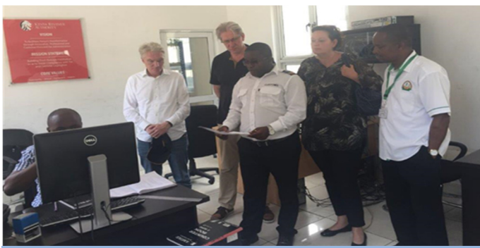
A visit to the port of Mombasa in 2019 (above ) Kenyan Avocadoes ready for export (below)