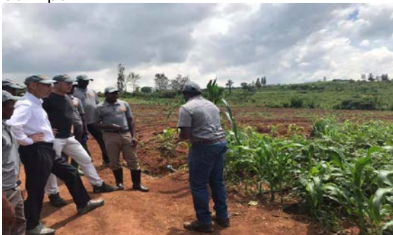
Picture: Sunripe Farm visit

After the farm visit the Ambassador and Agricultural Counselor also visited Ntarama Genocide Memorial to pay their respects to the victims of the genocide against the Tutsi.