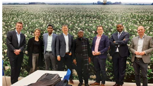
Picture: DG RAB and Rwandan ambassador to the Netherlands with the Dutch potato sector

From 11 – 13 December 2020, the DG of RAB visited the Netherlands for meetings with Wageningen UR on joint research applications and to meet and discuss with the Dutch seed potato sector in an attempt to increase their interest in investing in Rwanda and which steps Rwanda could take to attract more investors in the potato sector. Read more