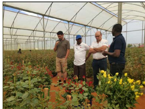
Picture: horticulture mission @ Bella Flowers

In the week of 21 November 2019, four Dutch investors came to Rwanda to look at investment opportunities. Three different sites have been visited and discussions took place with the RDB and NAEB. The mission surely sparked interest with the investors and we are expecting a larger group for the 2 nd mission end of January.