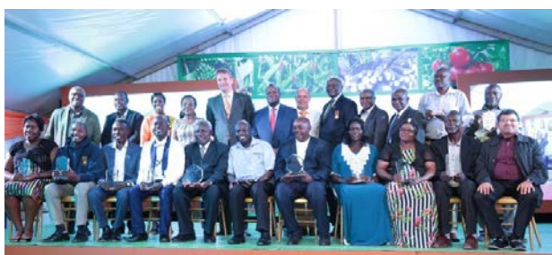
Picture: Winners, sponsors and judges together on stage during the 6 th edition of the Best Farmers Competition

The Netherlands Embassy, in partnership with DFCU bank, KLM, Koudijs and Vision Group are the sponsors of the Best Farmers Award, an initiative that is part of the 'Harvest Money' activities. The initiatives aims to highlight the potential of agriculture to economic development in Uganda. Also it positively affects the perception that most Ugandans hold toward agriculture as being a poor career option.