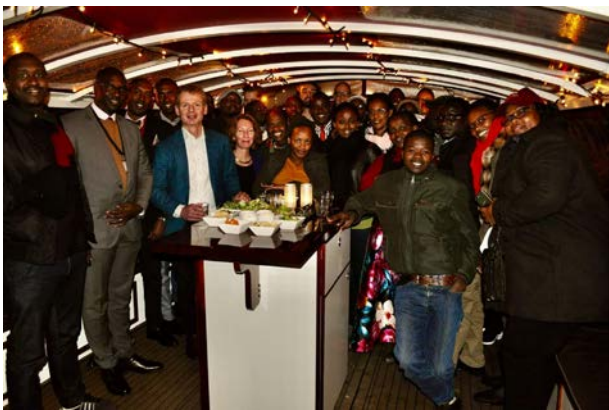
Picture: Rwandan coffee delegation in the Netherlands

In the week of 25 November a delegation of 25 coffee producers from Rwanda were in the Netherlands for the CBI - Centre for the Promotion of Imports from developing countries Market Orientation Mission Speciality Coffee Rwanda to develop a high value, sustainable specialty coffee export sector in Rwanda that can do independently business in EU markets.