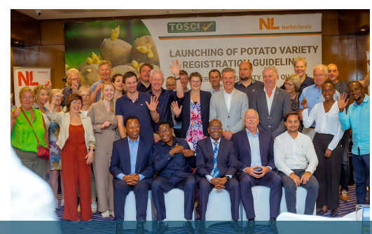
t is notable to see 30 HZPC potato seed breeders, researchers, farmers and trainers who visited Tanzania with the goal of conducting a needs assessment on new potato varieties in the country; during the launch event