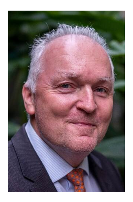
Ambassador Wiebe de Boer